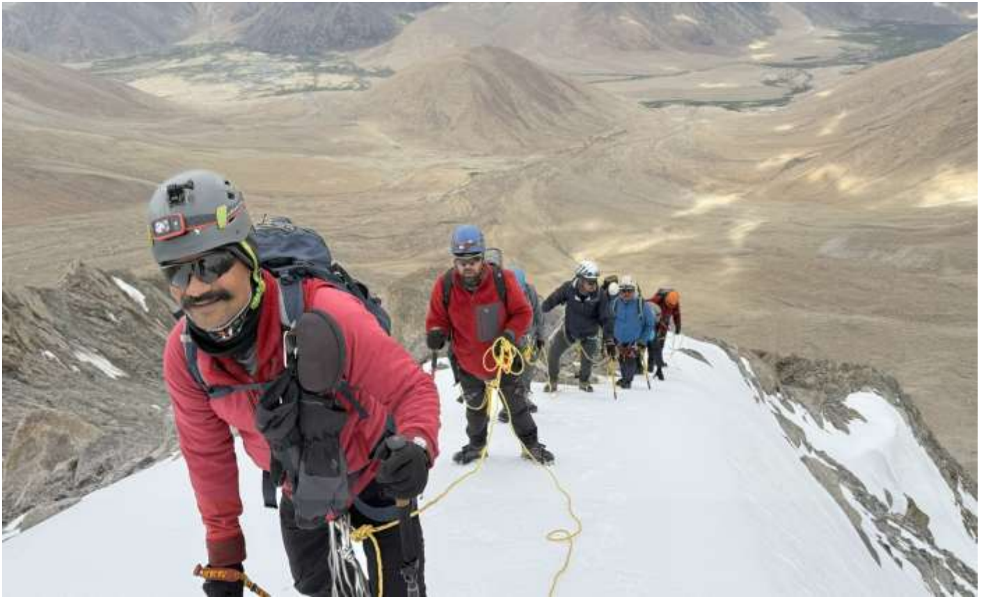
NEGOTIATING THE SNOWY SLOPE TOWARDS THE SUMMIT ON 29 JULY 2025 AT 0818 HOURS