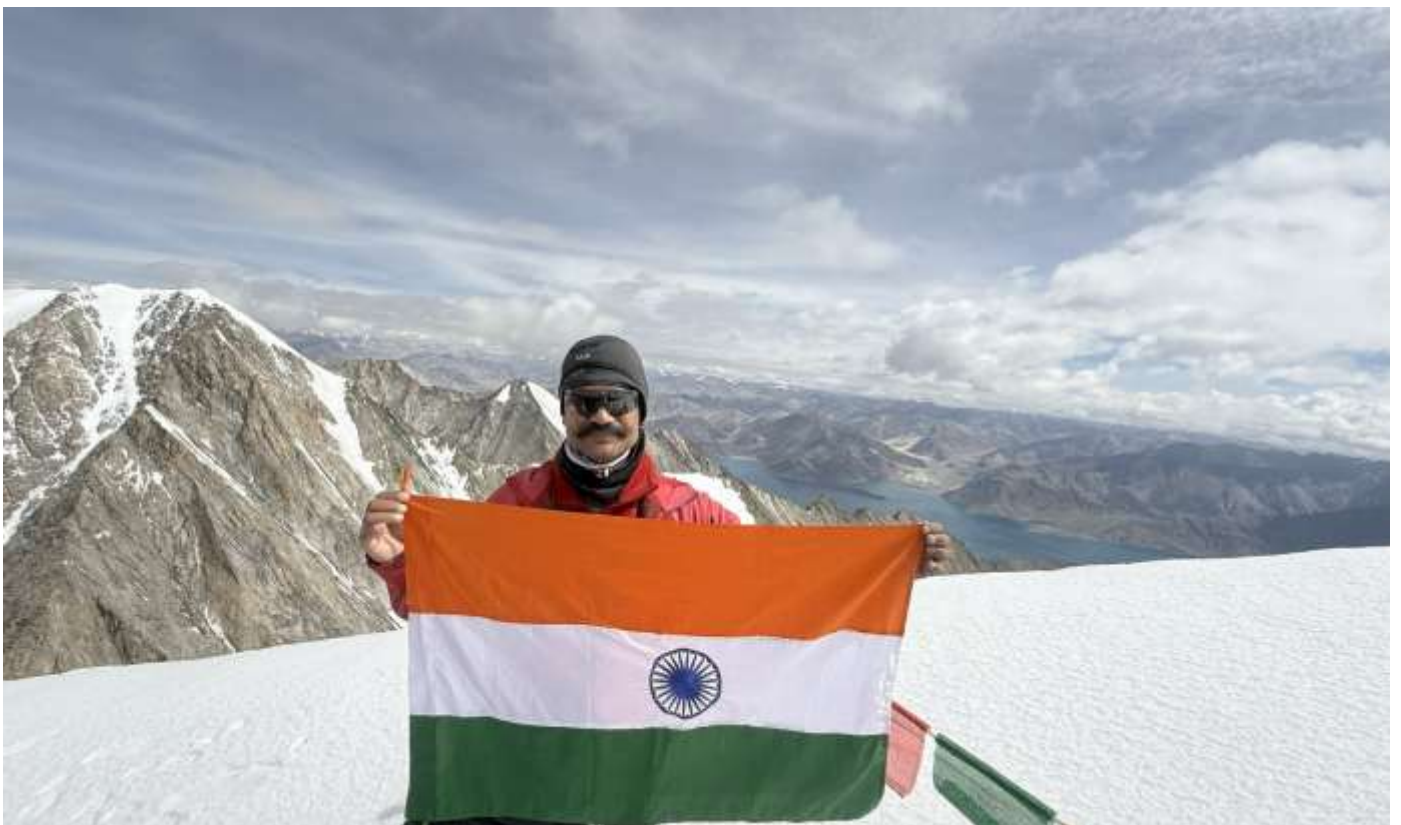
TEAM LEADER HOISTED BHARTIYA TIRANGA ON THE SUMMIT OF MT MERAG – III 6480 MTR AT 1022 HRS ON 09 JULY 2025