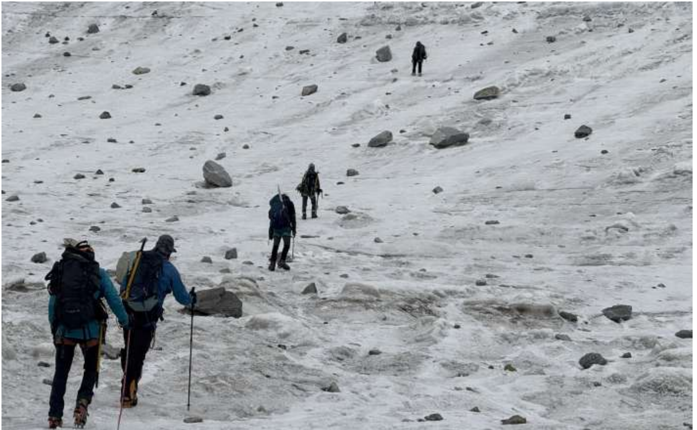
NEGOTIATING THE GLACIER TOWARDS THE SUMMIT CAMP IN ON 01 AUGUST 2025 AT 1200 HOURS