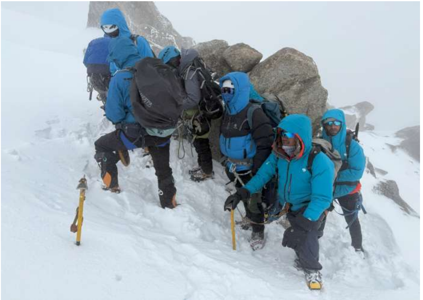
JOINT TEAM TAKING SHELLED OF ROCKY POSTURE IN DEADLY WINDS NEAR SUMMIT ON 02 AUGUST 2025 AT 1450 HOURS