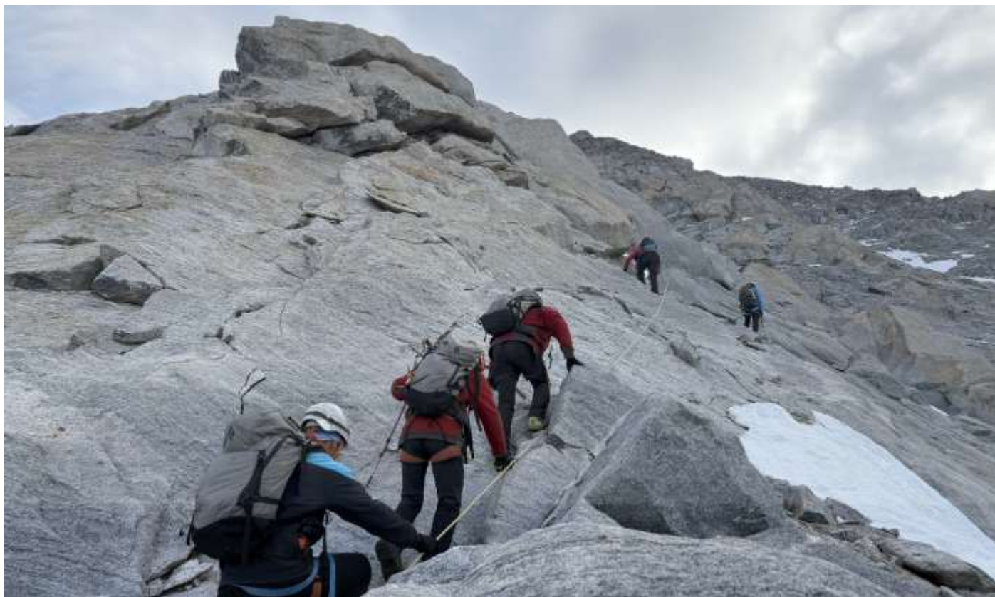
NEGOTIATING THE STEEP WALL TOWARDS THE SUMMIT ON 29 JULY 2025 AT 0615 HOURS