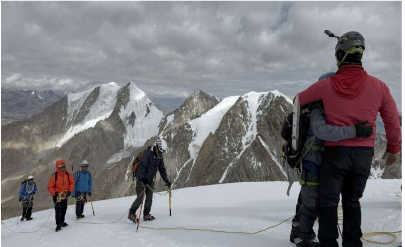
JOINT TEAM SUCCESSFULLY SCALED MT MERAG - III ON 29 JULY 2025 AT 0855 HOURS