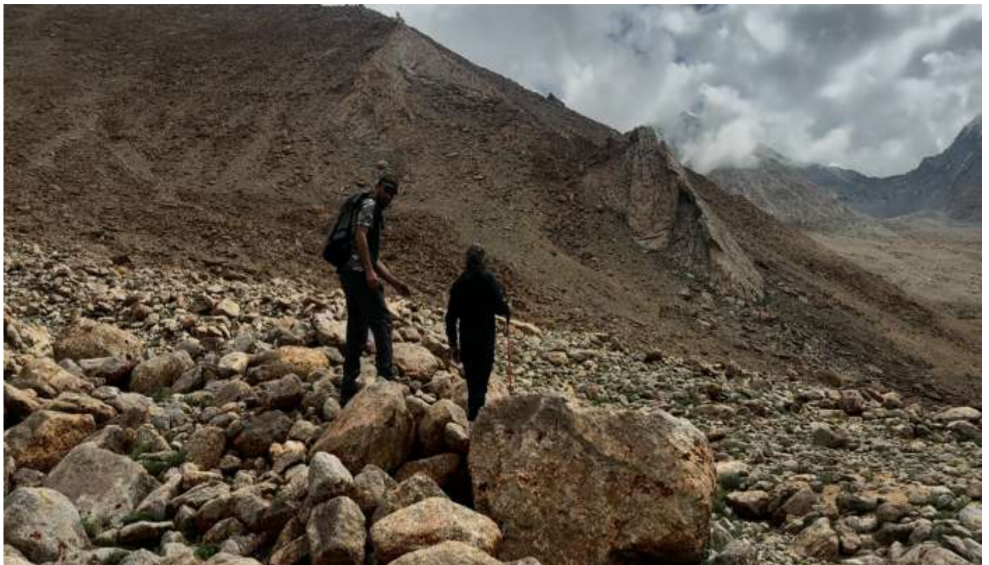
RECCE CUM ACCLIMATIZATION AT ROAD HEAD CAMP ON 26 JULY 2025 AT 0930 HOURS