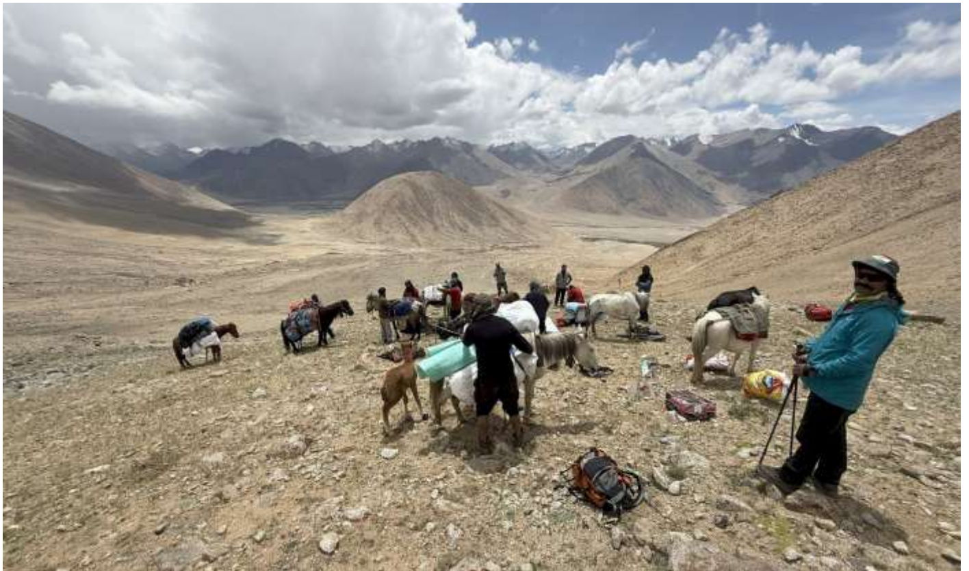
TEAM AT BASE CAMP ON 27 JULY 2025 AT 1311 HOURS