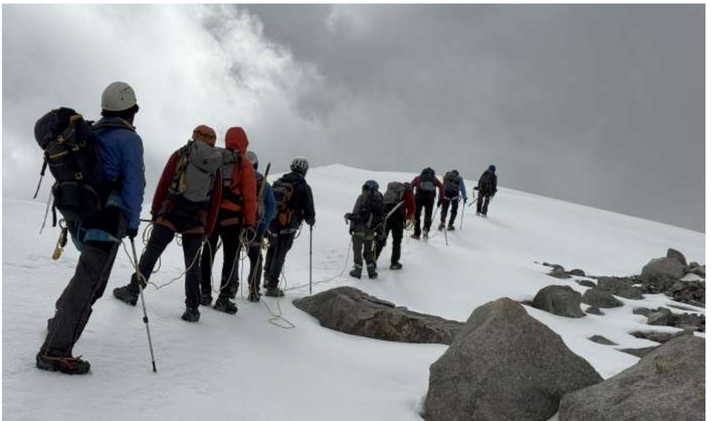
JOINT TEAM NEGOTIATING SNOW RIDGE NEAR THE SUMMIT ON 29 JULY 2025 AT 0845 HOURS