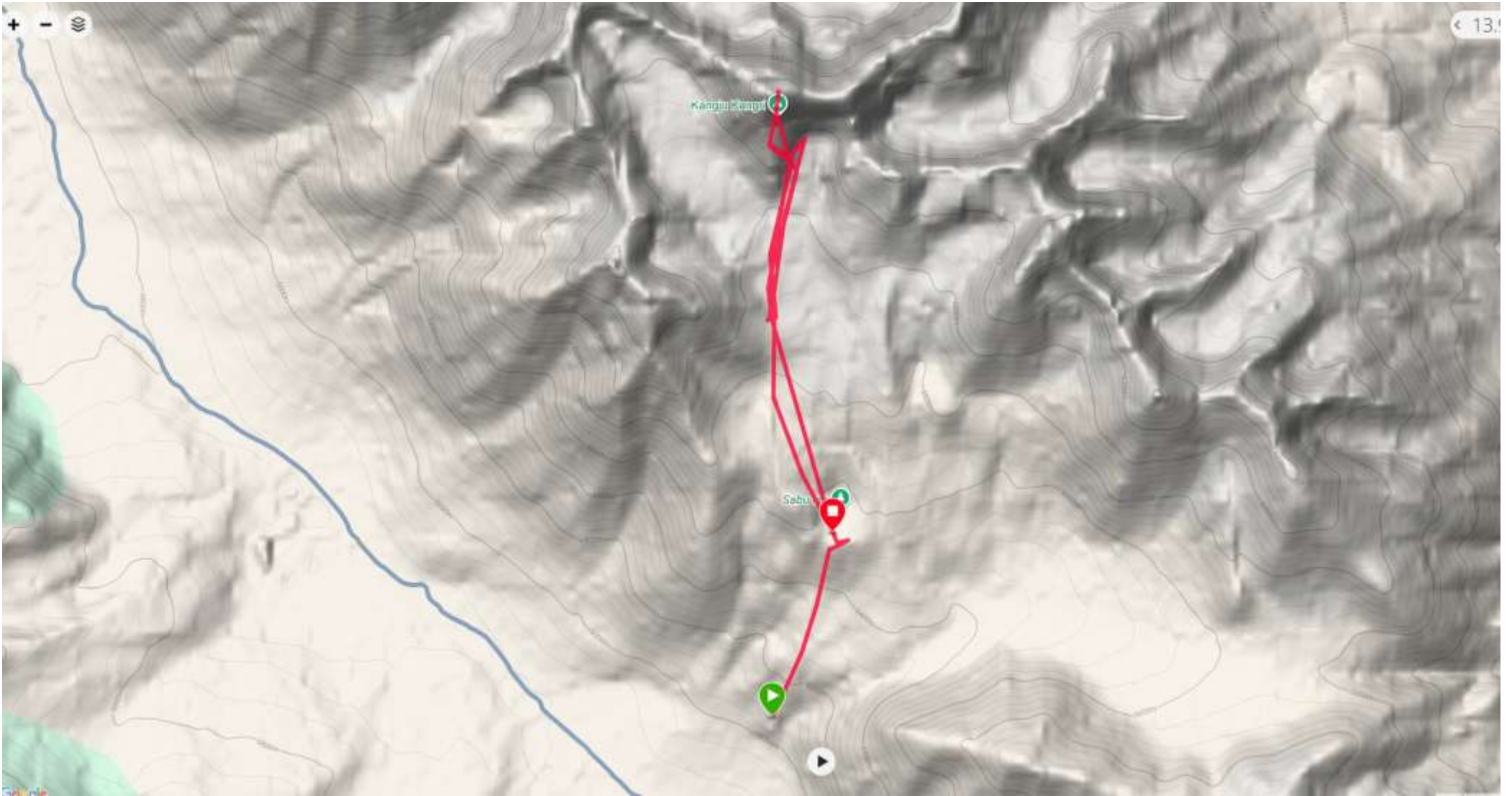
GPS TRACKING OF MT KANGJU KANGRI IN TEAM LEADERS WATCH ON 02 AUGUST 2025