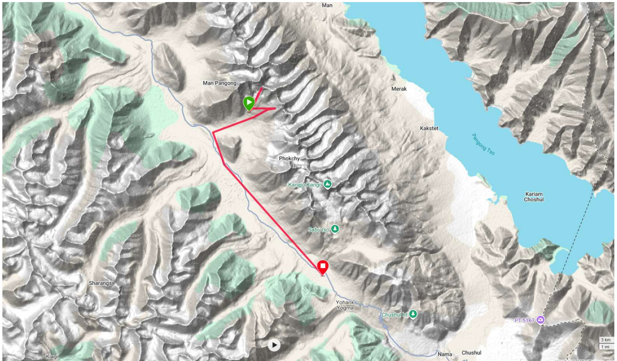
GPS TRACKING OF MT MEERAG - III IN TEAM LEADERS WATCH ON 29 JULY 2025