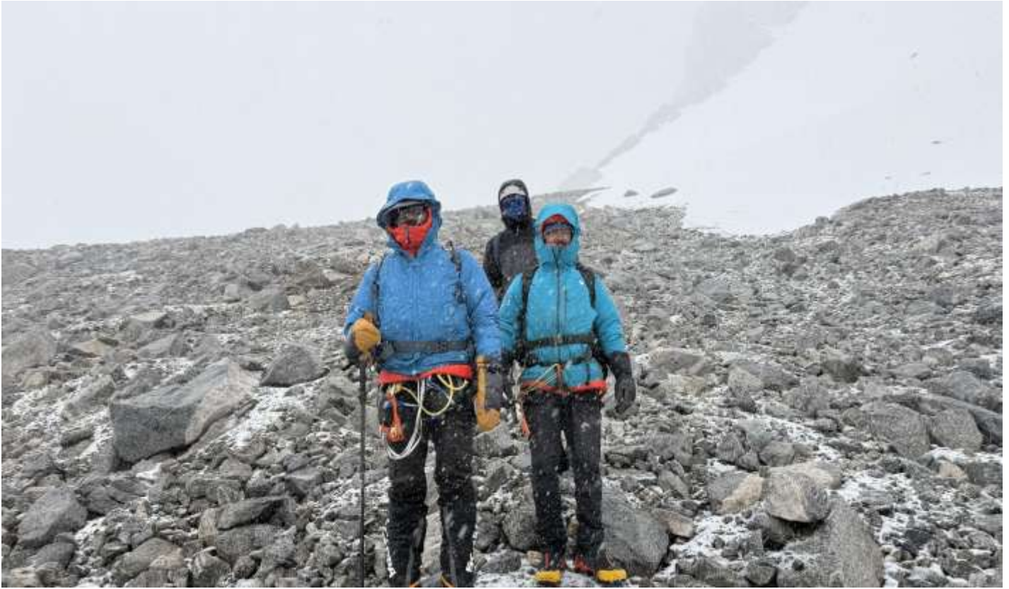
ONE TEAM TOWARDS THE BASE CAMP IN EXTREME WEATHER FOR LOAD FERRY ON 01 AUGUST 2025 AT 1630 HOURS