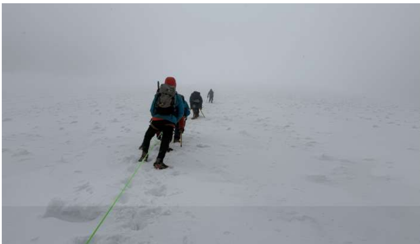
NEGOTIATING THE DEADLY SLOPE IN EXTREME WEATHER ON 02 AUGUST 2025 AT 1200 HOURS