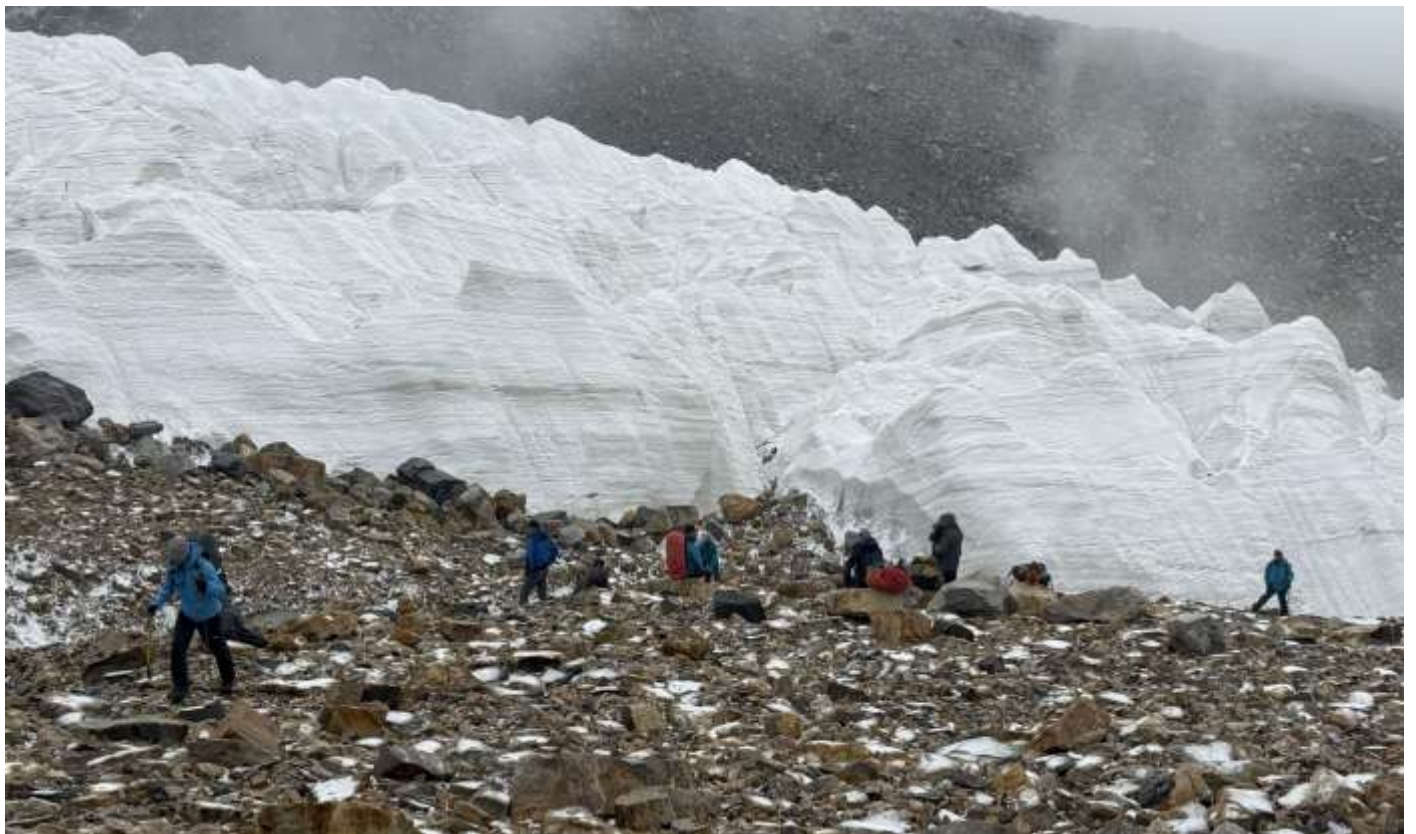
TOWARDS THE SUMMIT CAMP IN EXTREME WEATHER ON 01 AUGUST 2025 AT 0740 HOURS