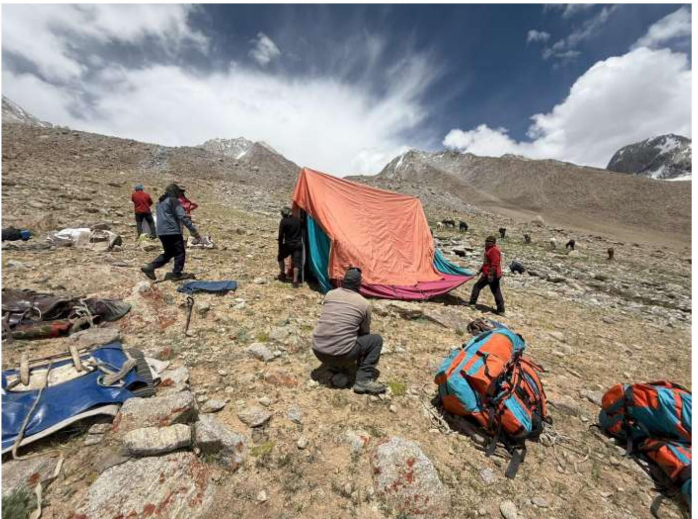
ESTABLISHED BASE CAMP ON 27 JULY 2025 AT 1330 HOURS