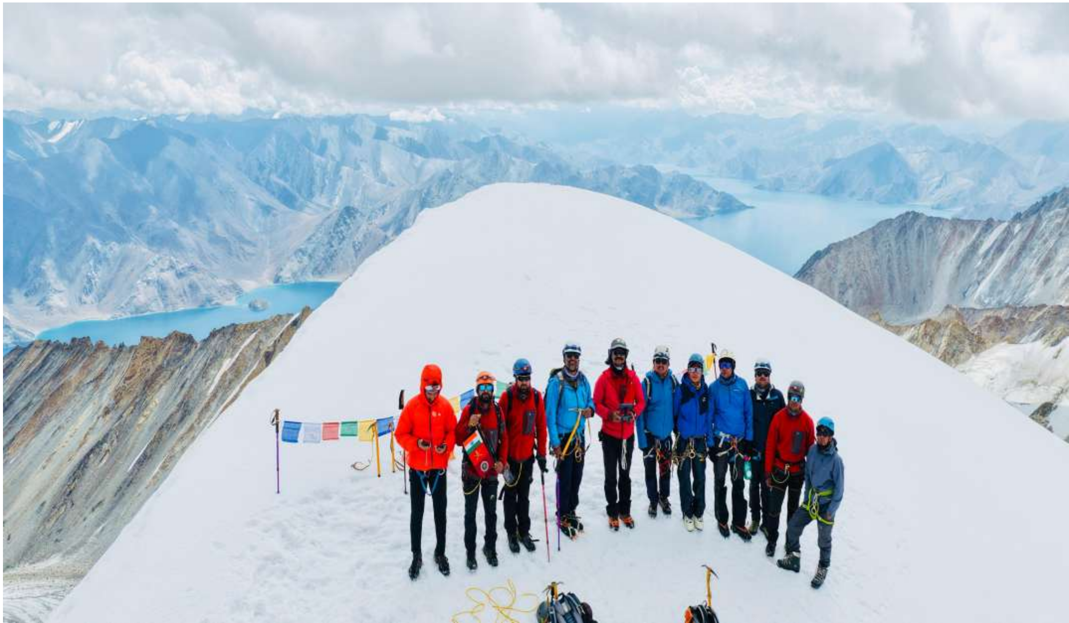
AERIAL VIEW OF MT MERAG – III ON 29 JULY 2025 BY QUADCOPTER (DRONE)