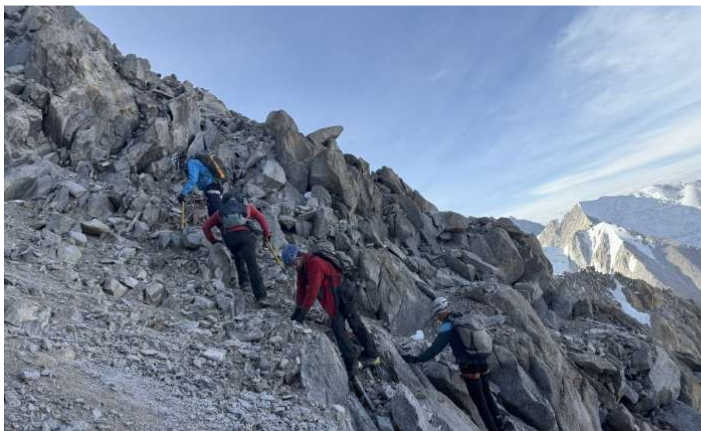
NEGOTIATING THE SCREE SLOPE TOWARDS THE SUMMIT ON 29 JULY 2025 AT 0721 HOURS