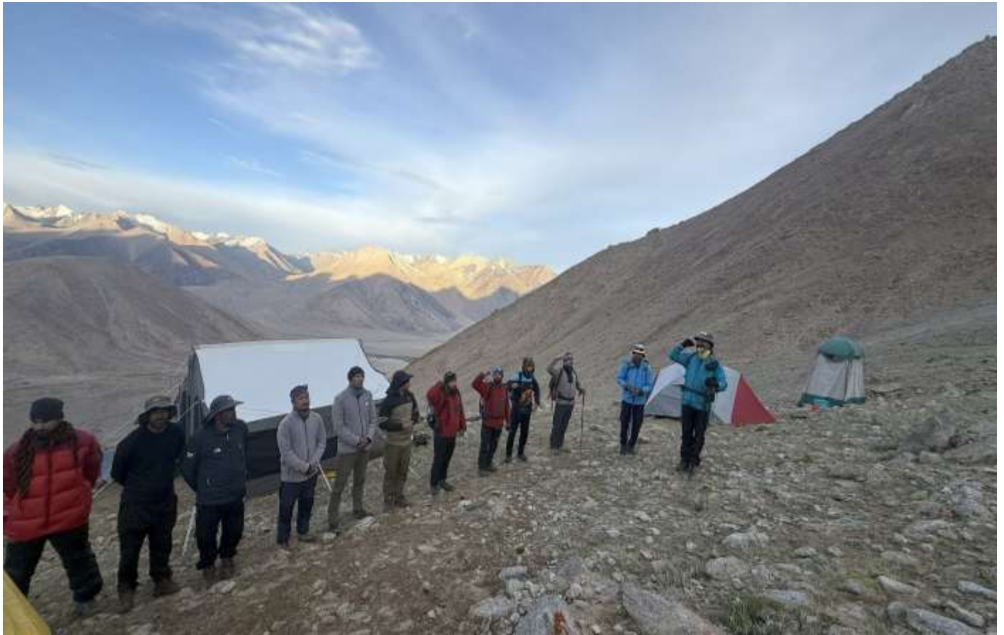
TEAM READY TO MOVE FOR ROUTE OPENING CUM RECCE OF MT MERAG – I ON 28 JULY 2025 AT 0600 HOURS