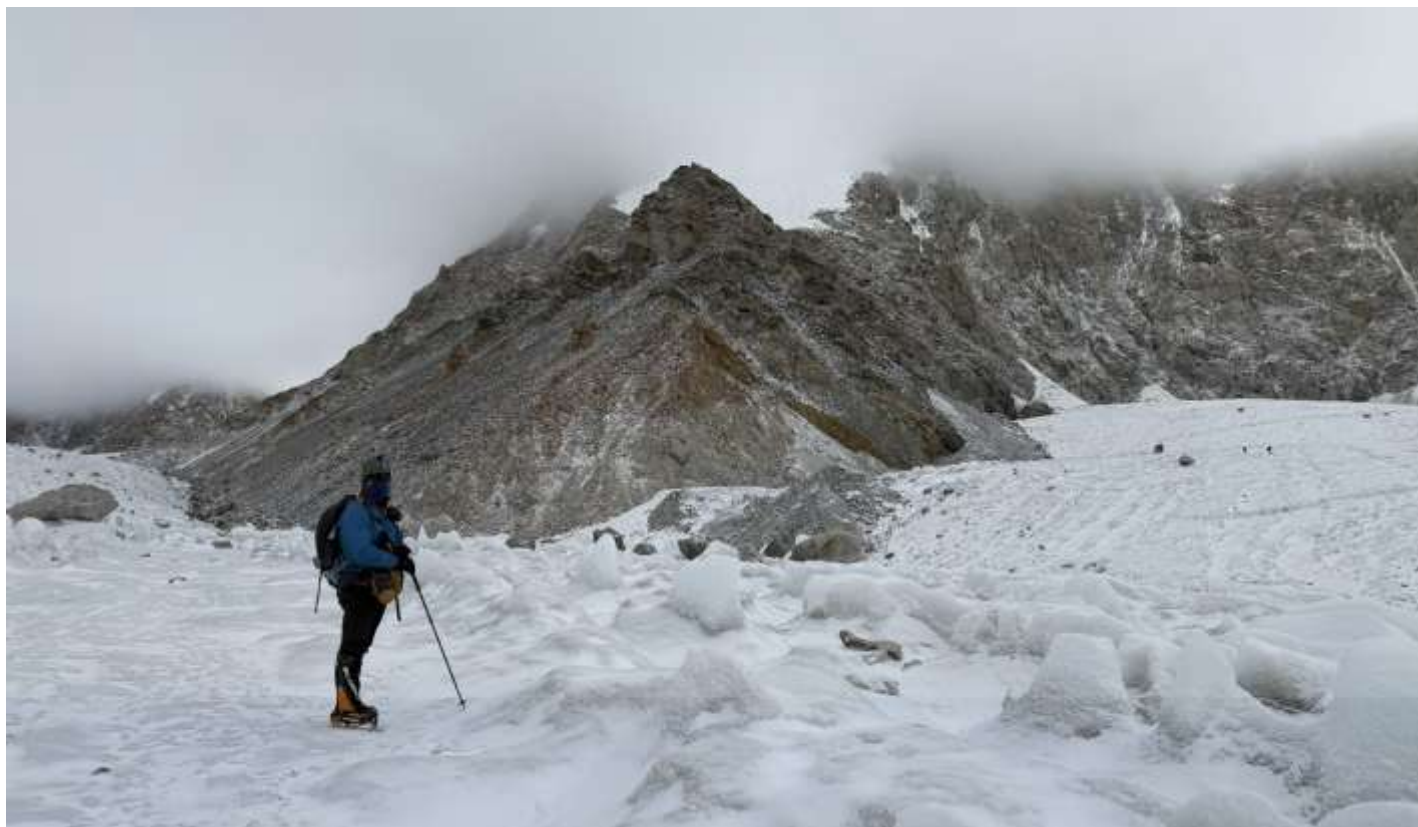
TOWARDS THE SUMMIT ON 02 AUGUST 2025 AT 0650 HOURS