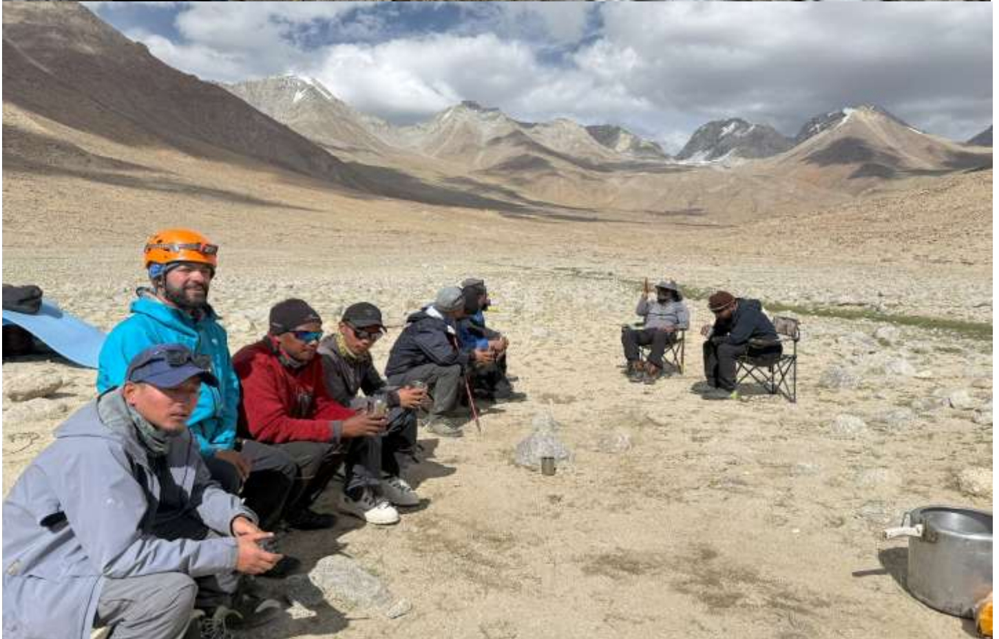
JOINT TEAM SAFELY DESCENDED TO BASE CAMP AT 1530 HRS ON 29 JULY 2025