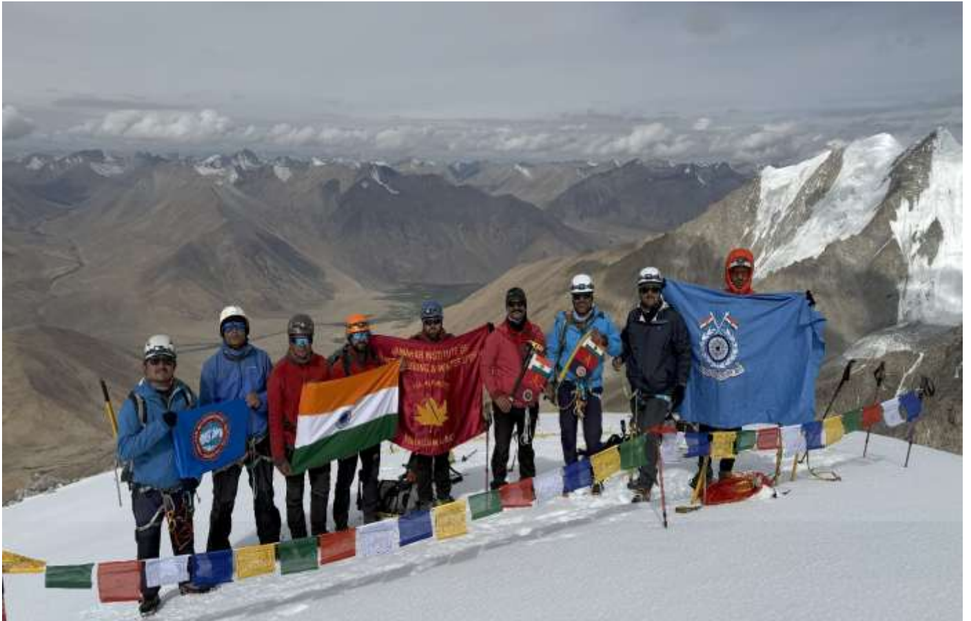
TEAM ON THE SUMMIT OF MT MERAG - III 6480 MTR AT 0810 HRS ON 06 JULY 2025 GRID REFERENCE N 33°47.2049' E 078°29.3223') RECORDED IN GPS