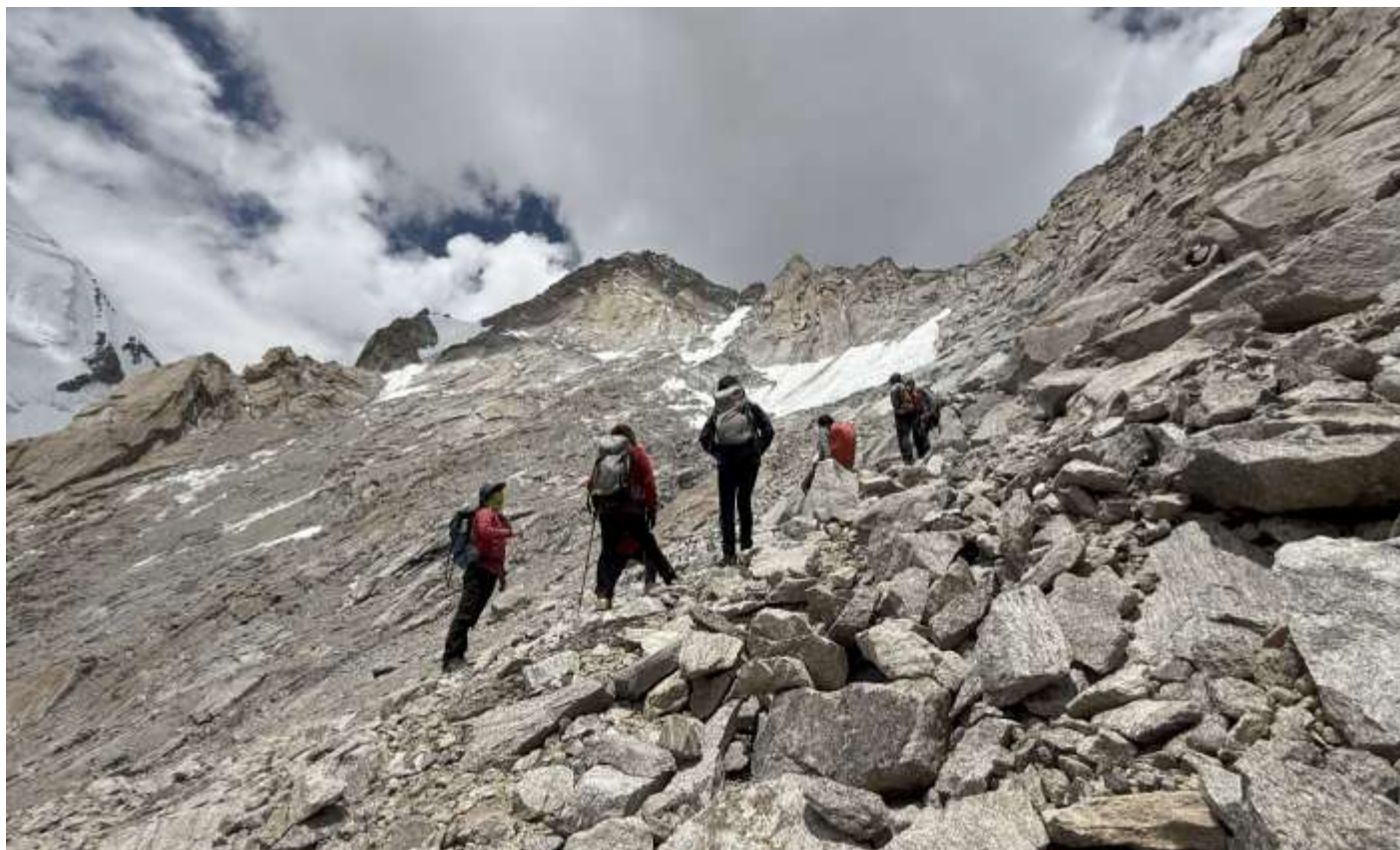
TEAM DECIDED TO SCALE MT MERAG – III RATHER THAN MT MERAG - I ON 28 JULY 2025 AT 1300 HOURS