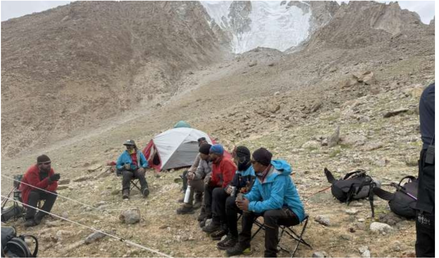
BRIEFING ABOUT SUMMIT PLAN OF MT MERAG – III BY TEAM LEADER ON 28 JULY 2025 AT 1500 HOURS