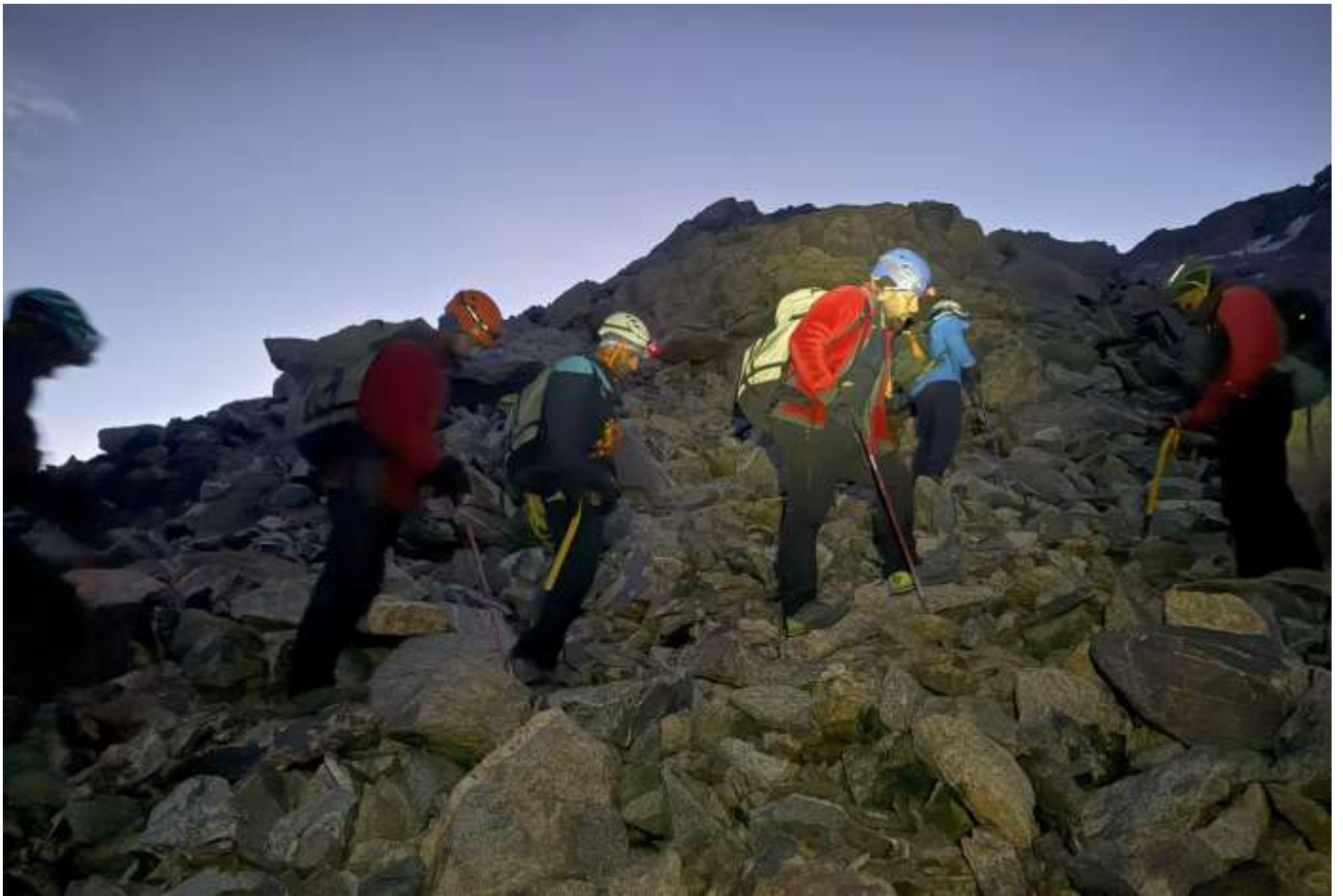
NEGOTIATING THE DEADLY SLOPE TOWARDS THE SUMMIT ON 29 JULY 2025 AT 0450 HOURS