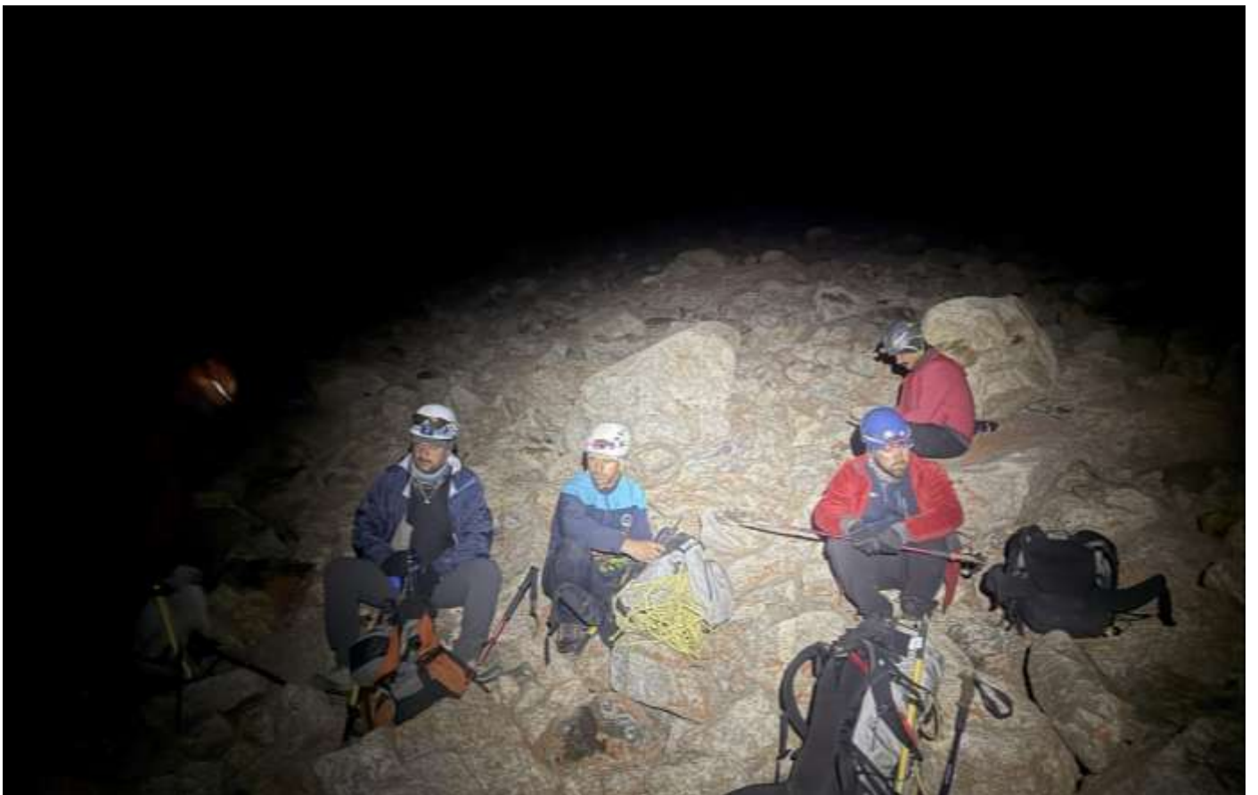
JOINT TEAM READY TO MOVE FOR SUMMIT OF MT MERAG – III ON 29 JULY 2025 AT 0200 HOURS