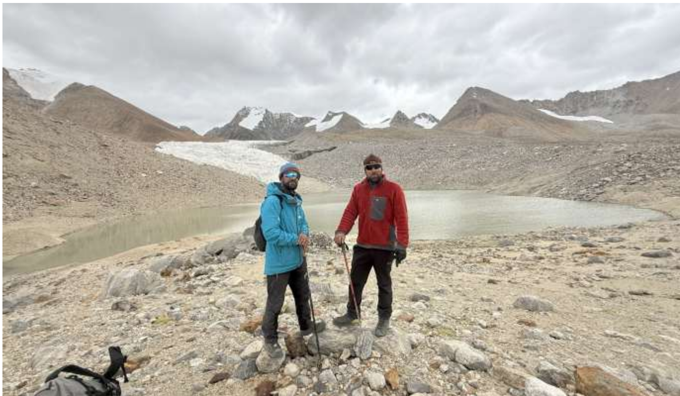
ON 30 JULY 2025 JOINT TEAM DID RECCE FOR BASE CAMP