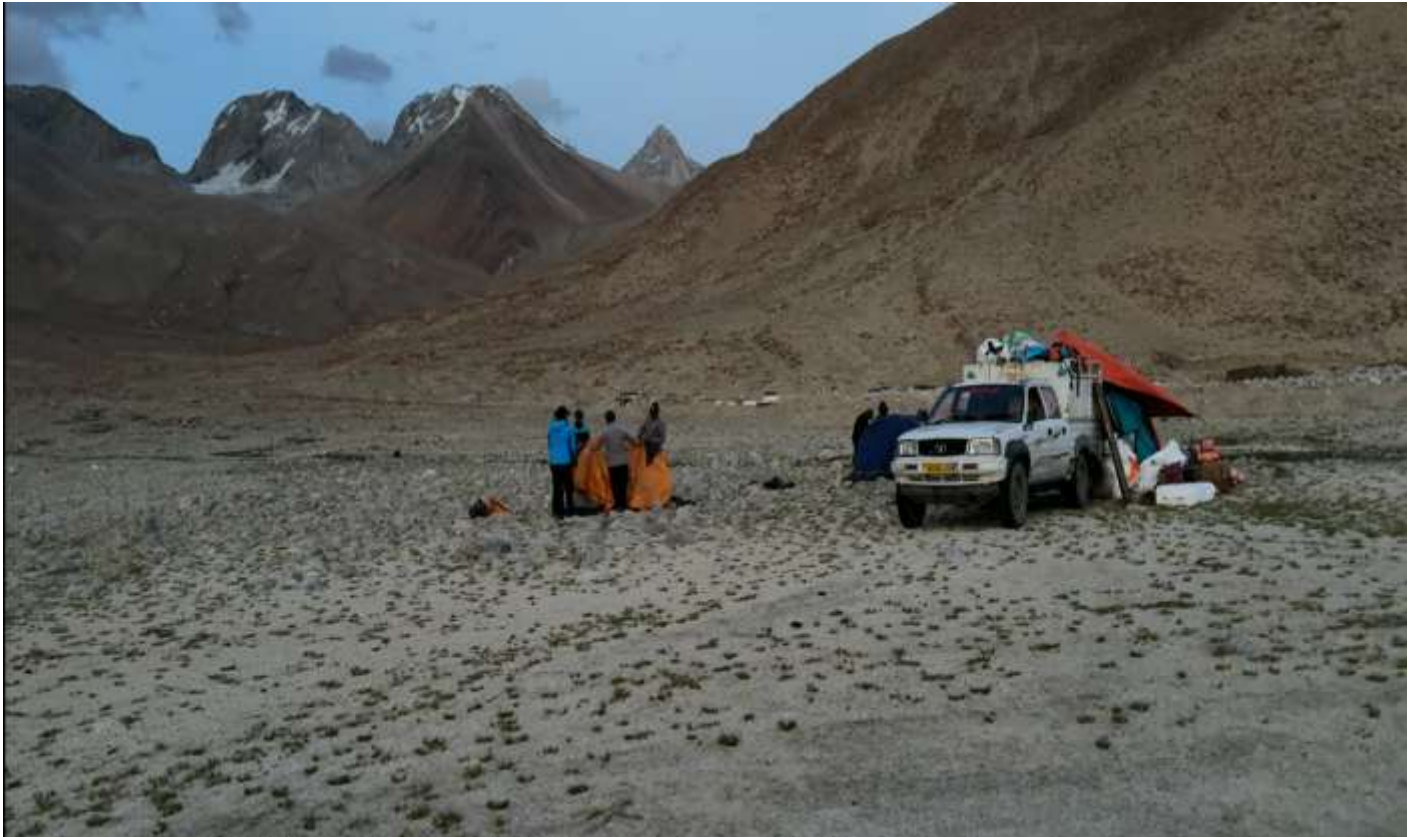
ESTABLISHED ROAD HEAD CAMP NEAR PARMA VILLAGE ON 25 JULY 2025 AT 1930 HOURS