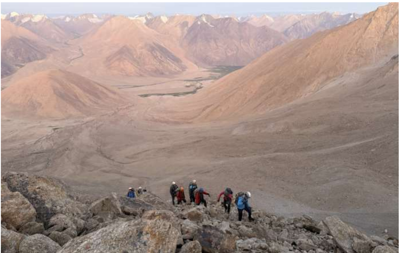
NEGOTIATING THE BOULDER AREA TOWARDS THE SUMMIT ON 29 JULY 2025 AT 0520 HOURS