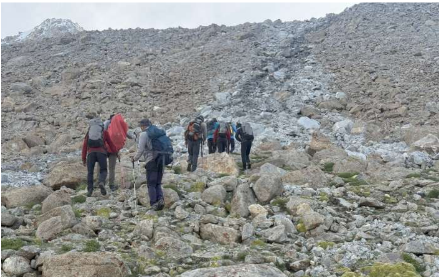
NEGOTIATING STEEP BOULDER SLOPE TOWARDS MT MERAG – I ON 28 JULY 2025 AT 0620 HOURS