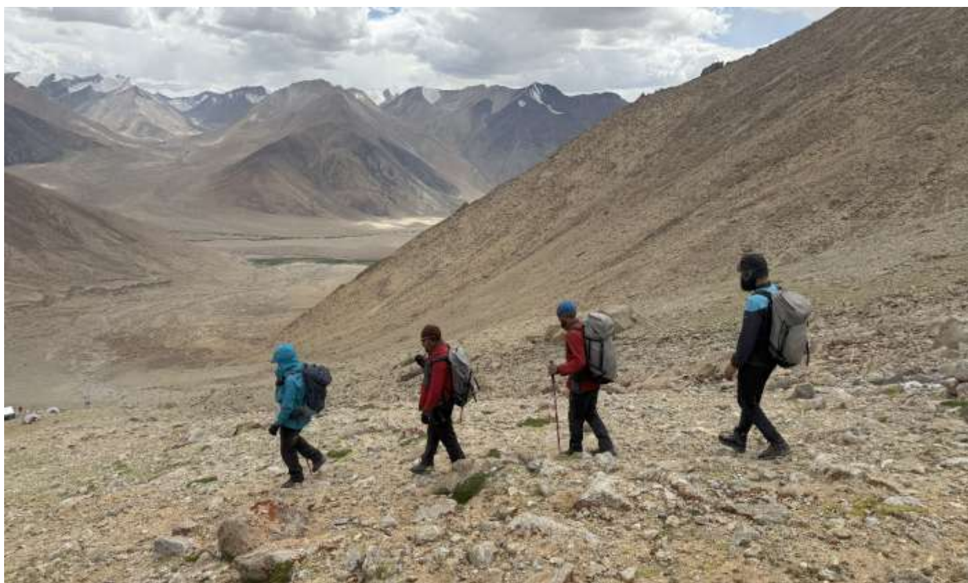
TEAM BACK TO BASE CAMP ON 28 JULY 2025 AT 1440 HOURS