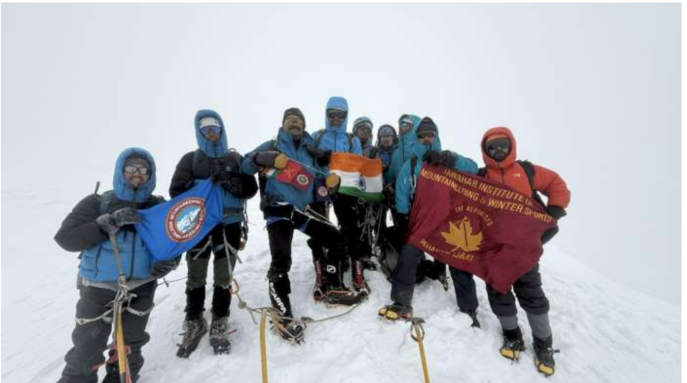
TEAM ON THE SUMMIT OF MT KANGJU KANGRI – 6710 MTR IN EXTREME WEATHER ON 02 AUGUST 2025 AT 1513 HRS GRID REFERENCE N 33°43'32" E 78°31'39") RECORDED IN GPS