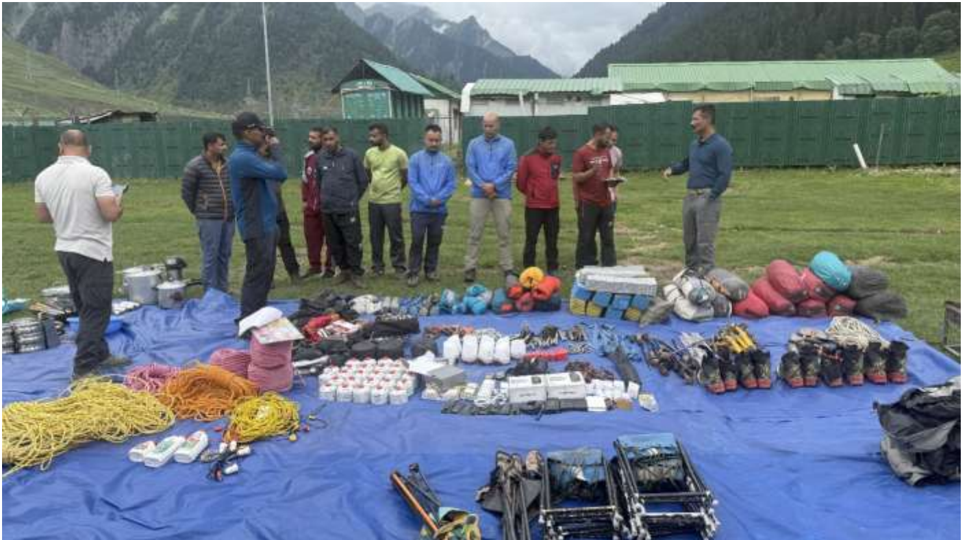
FINAL PREPARATION BEFORE MOVE ON 23 JULY 2025 AT 1100 HRS