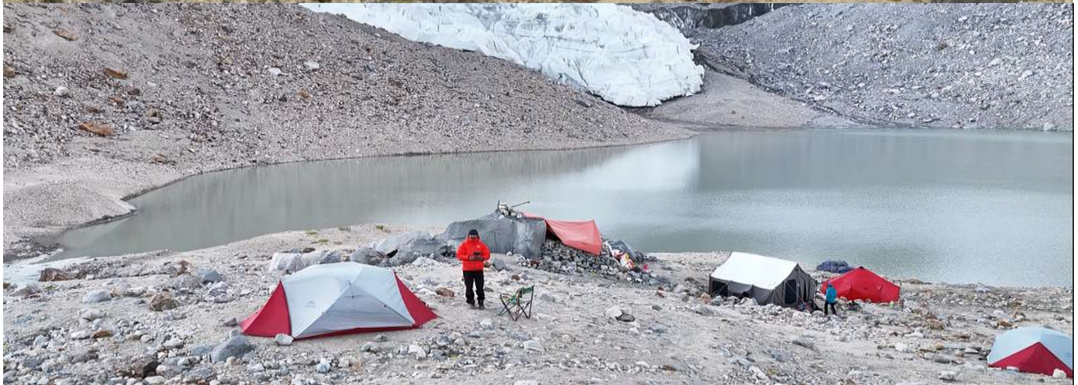
ESTABLISHED BASE CAMP NEAR MT KANGJU KANGRI GLACIER TARN ON 31 JULY 2025 AT 1420 HOURS