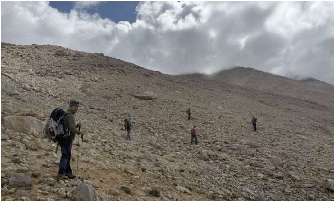
NEGOTIATING SCREE AREA TOWARDS BASE CAMP ON 27 JULY 2025 AT 0920 HOURS