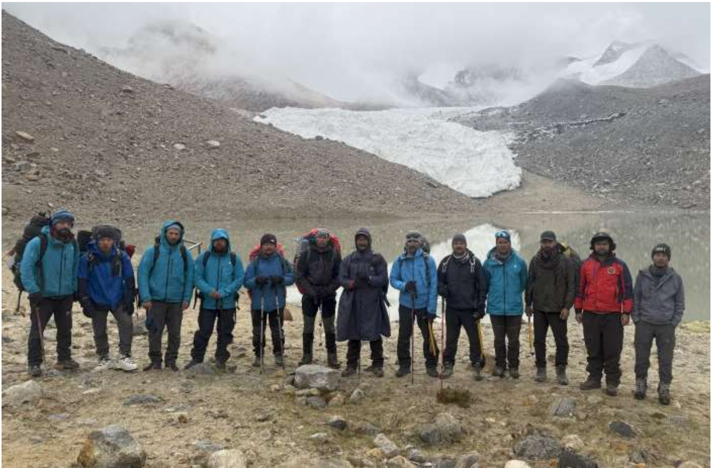
TEAM READY TO MOVE FOR LOAD FERRY CUM ROUTE OPENING TOWARDS THE SUMMIT CAMP ON 01 AUGUST 2025 AT 0700 HOURS