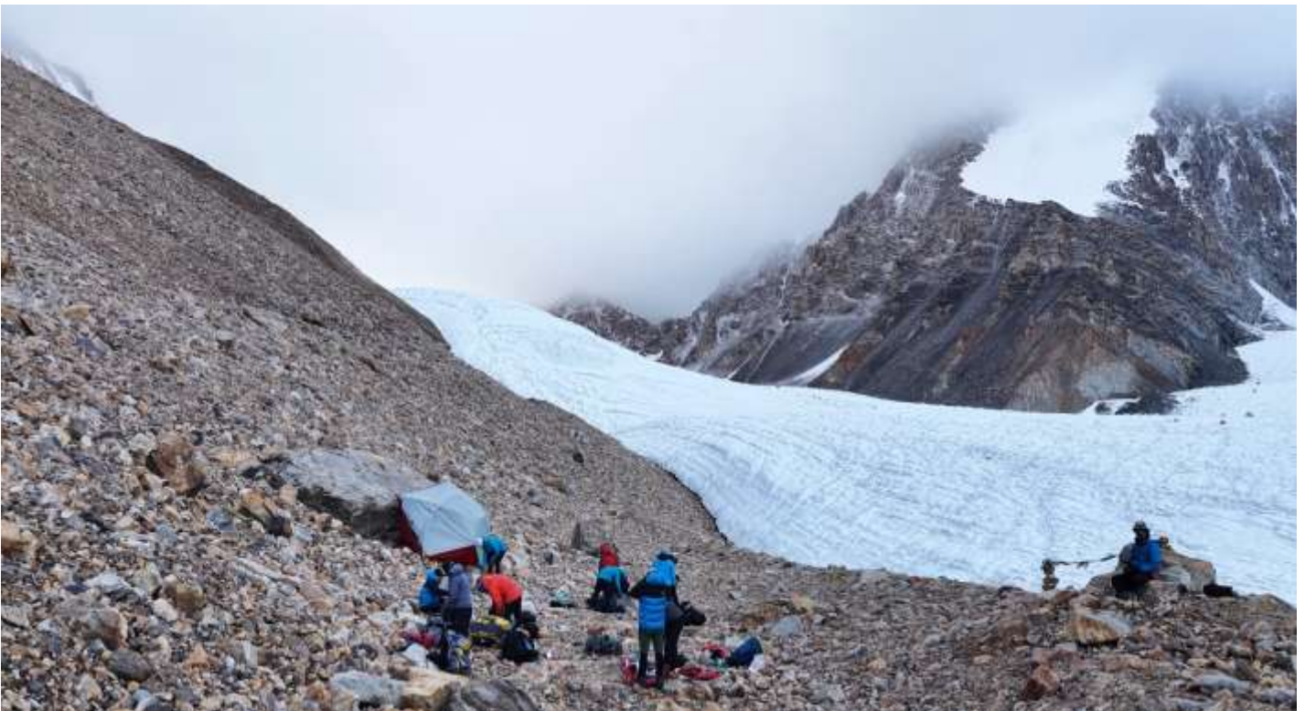
JOINT TEAM REACHED SUMMIT CAMP ON 01 AUGUST 2025 AT 1300 HOURS